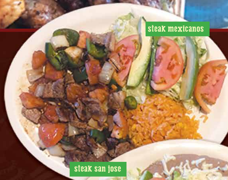
steak san jose