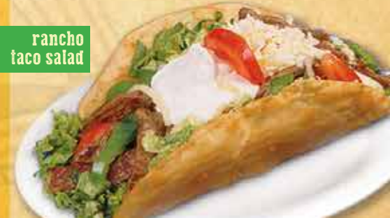
rancho taco salad

Steak* or chicken with hot peppers, onions and tomatoes. Served with lettuce, tomato, guacamole and sour cream - 16.99