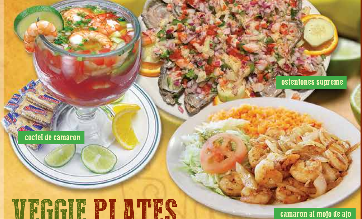
coctel de camaron

Shrimp with cucumbers, red or green sauce and hot lime sauce - 25.99