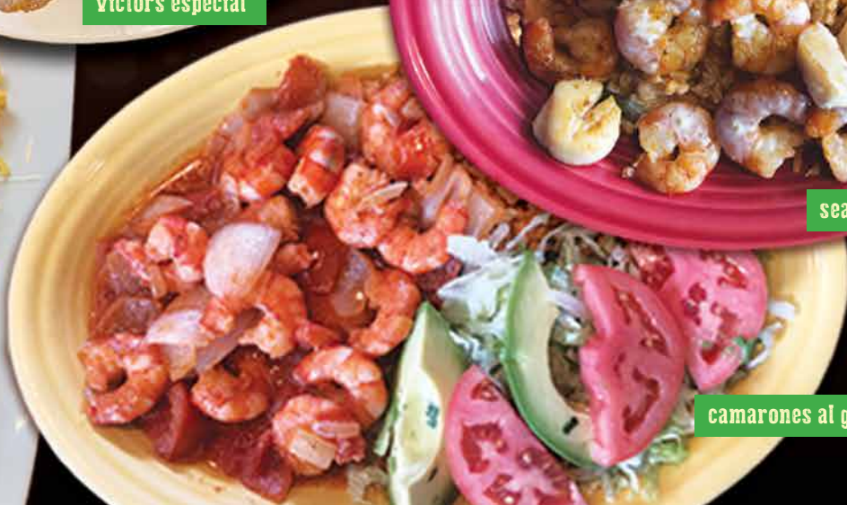
camarones al gusto