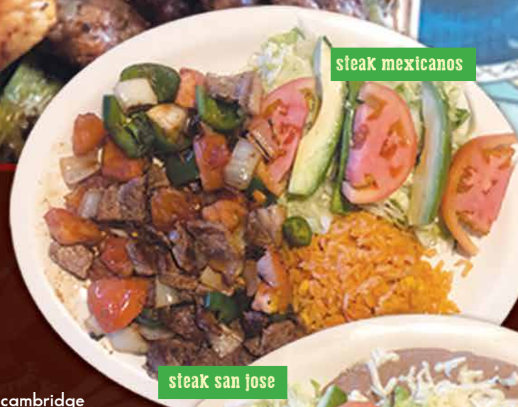
steak san jose